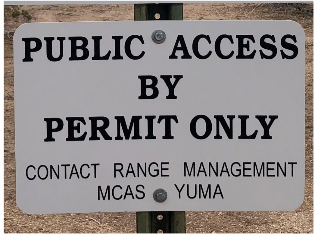
Public Access Area Sign